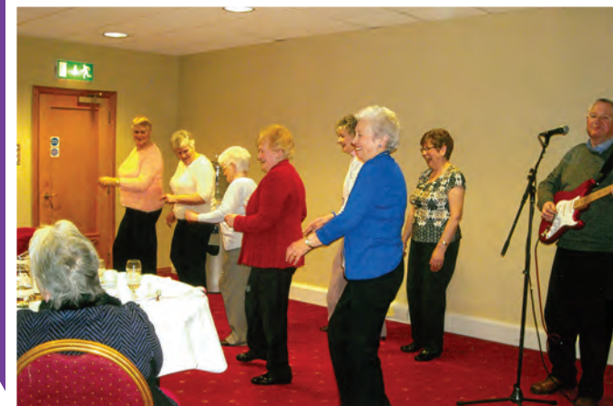
Some MU members of Cloughfern enjoy 'The Slush' following dinner in the Clarion Hotel.