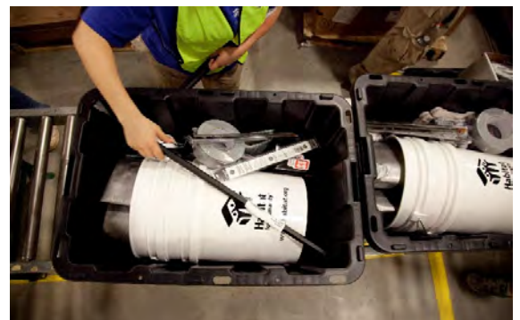
Example of an emergency shelter kit.

Just £132* could provide an emergency shelter kit to a family in desperate need of shelter. We urgently need your help to reach as many families as possible.