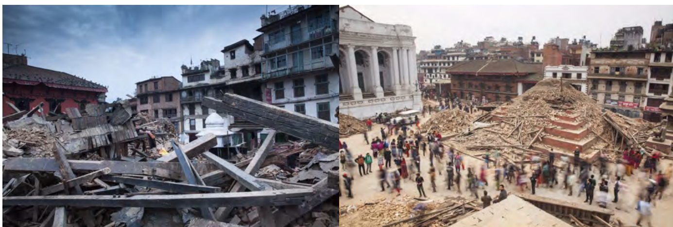
Scenes of destruction in Kathmandu after Saturday's devastating earthquake.

Visit: www.HabitatNI.co.uk Email: emmah@habitatni.co.uk Telephone: 028 92 635 635