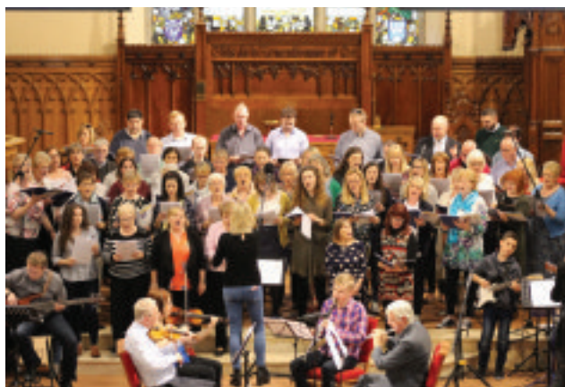
The Connor Big Sing in Lisburn Cathedral

There was excellent support for the Bishop of Connor's annual Lent seminars which