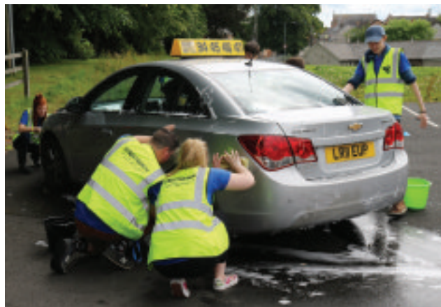
Working hard at the carwash during Streetreach in Crumlin and Glenavy