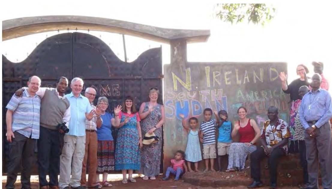
Lisburn Cathedral's team visiting a refugee camp in Arua.

CMS Ireland ( www.cmsireland.org ) supports a number of initiatives by its global partners as they provide care and assistance to refugees, internally displaced persons, and those who are returning home after being displaced.